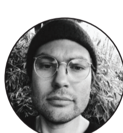
Planning Officer at the Municipality of Gothenburg

The pandemic has brought with it an increased focus on local perspectives and with that comes focus on land use. The importance of sustainable land use is very evident. For some places that might mean small scale farming in semi-urban areas to provide food for the local network, in other places something different entirely. Another essential factor, that I think the Saturn project provides, is international cooperation. A decrease in international traveling and international trading, due to either the pandemic or climate change, could decrease the international cooperation. Therefore I think It's great how the Saturn projects provides a platform for international cooperation in these issues.