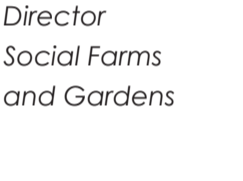
Chris Blythe - Director Social Farms and Gardens

SATURN is very well placed to tie all these agendas together, given its operation across 3 very well established and linked themes and scales. By bringing together projects and ideas on a city and wider scale, SATURN enables us to share good practice, learn from others, and hopefully start to make some small changes to the systems that need to change.